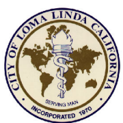
City of Loma Linda Land Use Map Figure 2-1